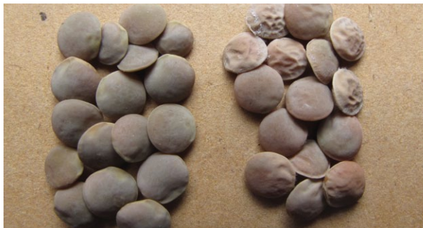
Lentils harvest pre (left) and post-rain (right), showing seed coat wrinkling and discolouration. Weather damaged pulse seed is more vulnerable to physical damage during handling.