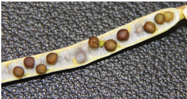
On sprouted canola seed in the centre of the pod – the funiculus that connects the seed to the pod should not be confused with a sprouting embryo.